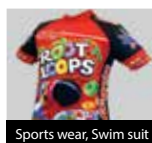
Sports wear, Swim suit