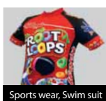
Sports wear, Swim suit